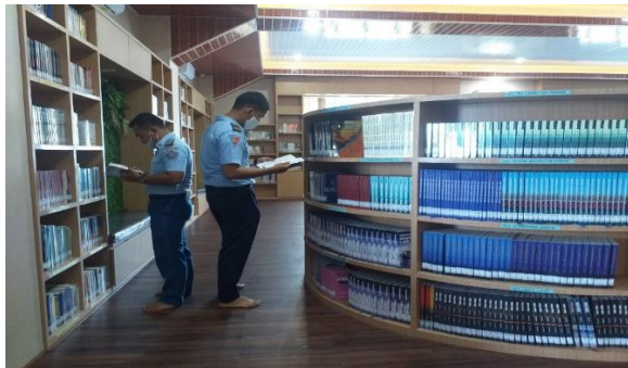
Figure 2 : Indonesian Maritime Adiguna Polytechnic Library Medan