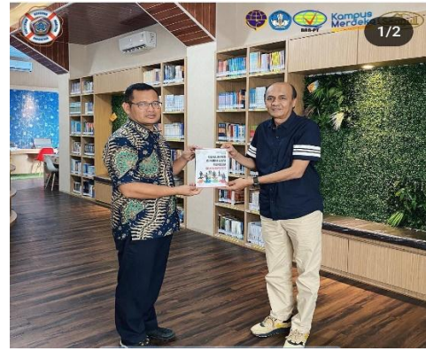
Figure 4 : Submission of Library Books by the Chairman of the Board of Trustees and Director