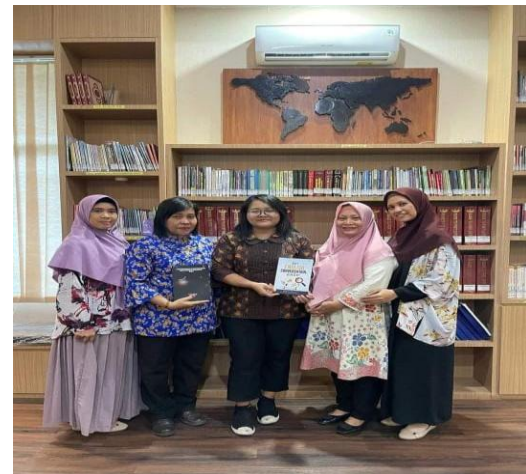
Figure 5 : Submission of Library Books by Lecturers of the Indonesian Maritime Polytechnic Medan Conclusion

Librarians have a crucial role in supporting academic research. They not only provide access to information resources, but also play a role in helping researchers develop information literacy skills and utilize technology in research. To optimize this role, libraries need to improve digital infrastructure and provide training to librarians related to information technology and research data management. Libraries play a major strategic role in coordinating the academic research component of the Tri Dharma undergraduate program. The work of libraries, especially academic librarians, does not only provide access to materials to study; They also play an important educational and service role in the research process. Librarians specializing in academic research can advise faculty on research projects and coordinate information literacy education programs to help faculty members develop their research abilities.