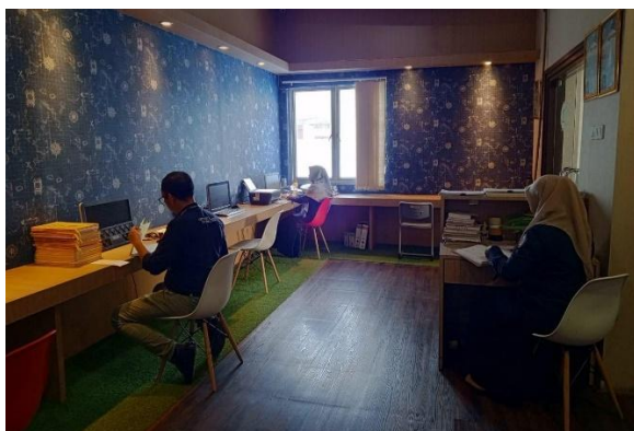
Figure 3 : Librarian of the Indonesian Maritime Adiguna Polytechnic Medan